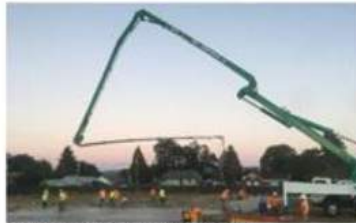
Concrete pump truck with crew pouring slab.