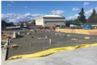
Entry/admin and gym area concrete slab preparation.