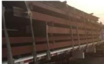
First steel deliveries - 2 of 2 loads.