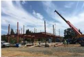
Steel erection at NE corner of new building.