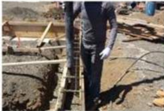
Pouring concrete stem walls.